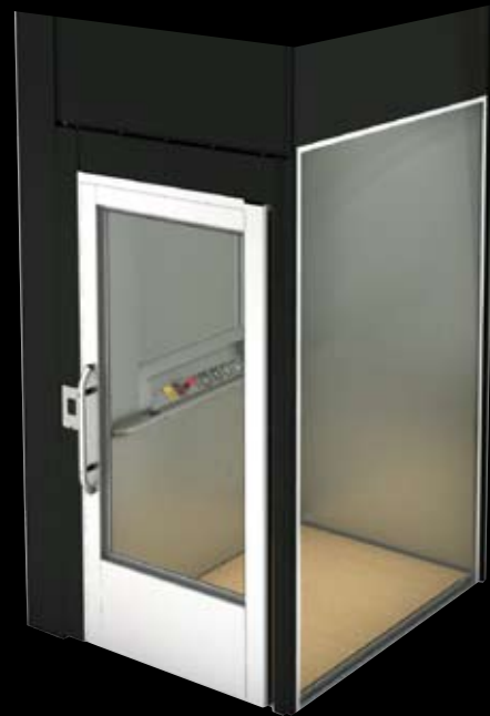
PRIME C 7000

PRIME CUSTOM is designed to fit into any environment, suit any project. With a variety of options, the lift can be customized according to your needs and tastes. Your choices include glass walls, a lift in any colour. PRIME CUSTOM also comes in a range of sizes.